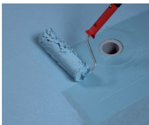
Application by roller of the second coat of Mapelastic AquaDefense Zero