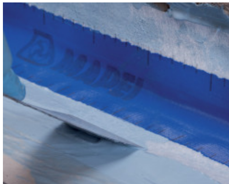
Application of Mapeband on a wall-floor fillet joint with Mapelastic AquaDefense Zero