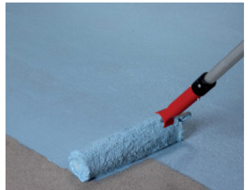
Application of the first coat of Mapelastic AquaDefense Zero on a screed