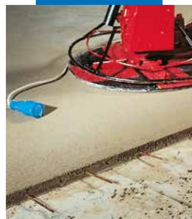
Power floating the surface of a Topcem screed