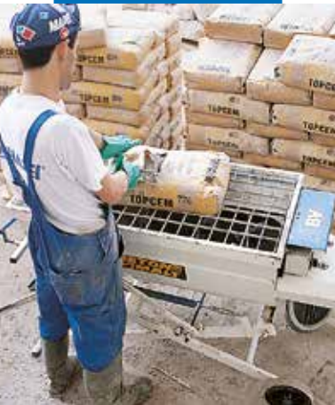
Mixing Topcem in a mini-batcher