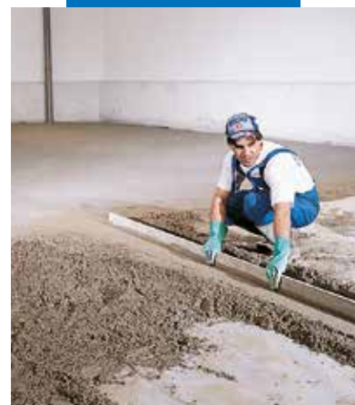
Preparing a levelling strip

Please refer to the current version of the Technical Data Sheet, available from our website www.mapei.com