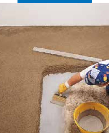
Spreading the anchoring slurry for bonded Topcem screeds