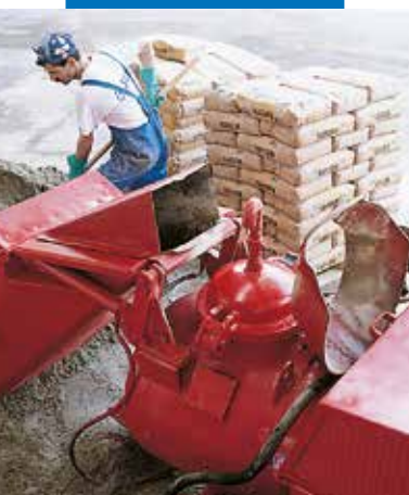
Mixing Topcem with an automatic pumping unit