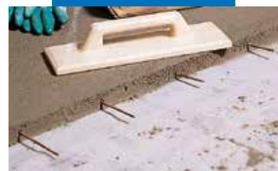
Detail of a Topcem screed with reinforcement rods