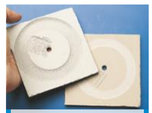
Taber abrasion executed on Ultraplan (right specimen) and on conventional levelling (left specimen) after 200 cycles