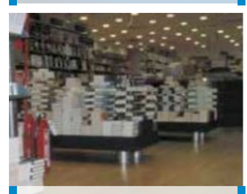
An example of an installation of timber flooring on a surface levelled with Ultraplan - Messagerie Musicali - Rome - Italy

Slab levelled with Ultraplan ready for fixing a floating floor