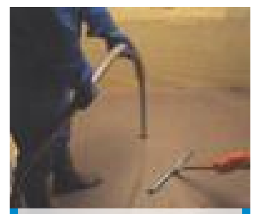
Application of Ultraplan with pump and squeegee

1.6 kg/m<sup>2</sup> per mm of thickness.