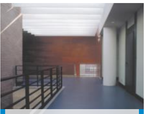
An example of an installation of linoleum on a surface levelled with Ultraplan - Monzòn Conservatory -Spain