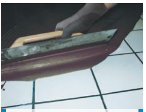
Application of Ultraplan with a metal trowel on an existing ceramic tile floor after the application of Eco Prim T Plus