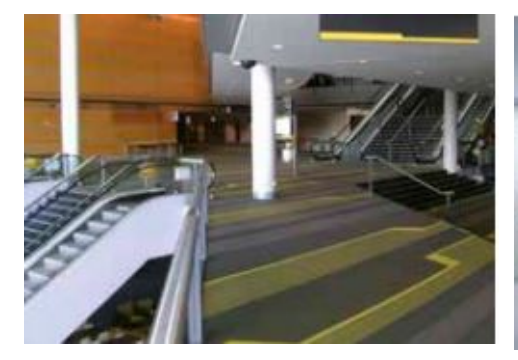
Brisbane Convention Centre - Carpet installed at the Brisbane Convention Centre after the concrete was levelled with Ultraplan