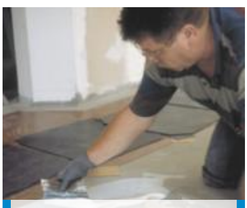
An example of an installation of inlayed PVC on a surface levelled with Ultraplan - CD2 - Milan - Italy