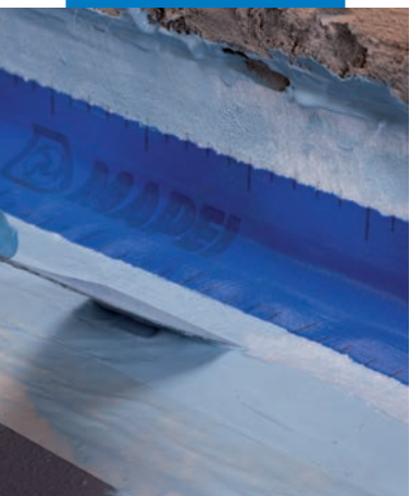
Application of Mapeband on a wall-floor fillet joint with Mapelastick AquaDefense