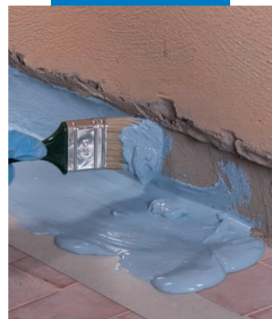
Application of Mapelastic AquaDefense by brush between floor and wall before applying Mapeband