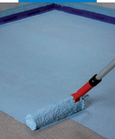
Application of the first coat of Mapelastick AquaDefense on a screed

Tiles installed on Mapelastick AquaDefense by using C2F-class MAPEI adhesives (such as Keraquick Maxi S1 or Granirapid .) and grouted with Ultracolor Plus may be opened to pedestrian traffic within 12 hours of starting the work.