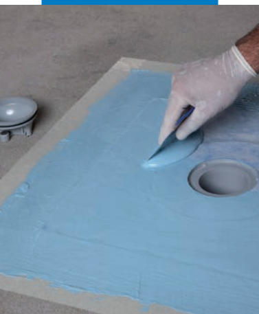
Impregnating Drain Vertical fabric with Mapelastick AquaDefense