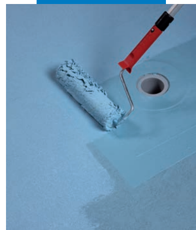
Application by roller of Mapelastic AquaDefense second coat

Bond values according to EN 14891 measured using Mapelastic AquaDefense and a C2-type cementitious adhesive according to EN 12004