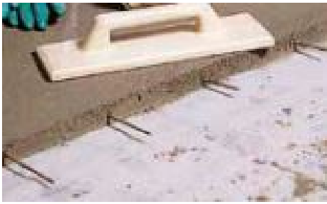
Detail of a Topcem screed with reinforcement rods