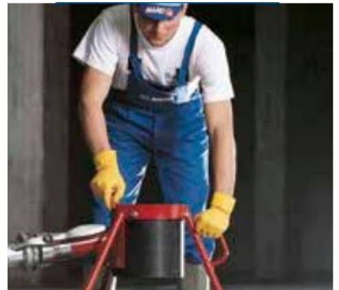
Batching a Topcem mix