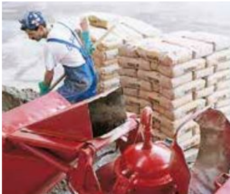
Mixing Topcem with an automatic pumping unit