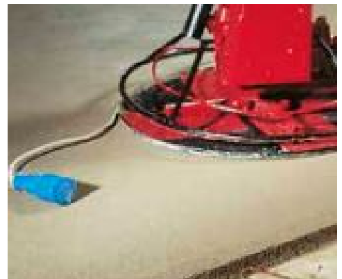
Power floating the surface of a Topcem screed