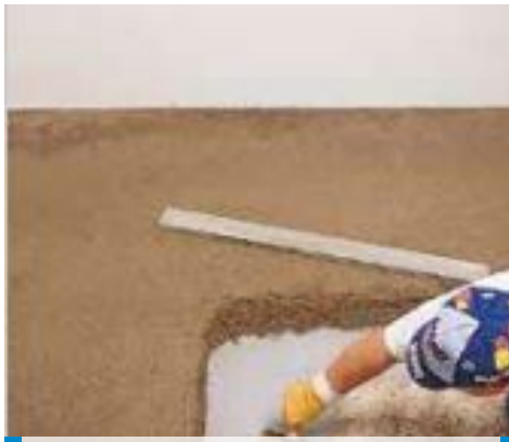
Spreading the anchoring slurry for bonded Topcem screeds