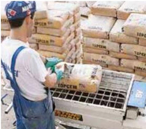
Mixing Topcem in a mini-batcher

Topcem can be stored for 12 months in a dry place in the original packaging.