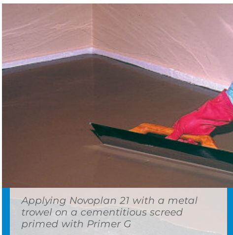
Applying Novoplan 21 with a metal trowel on a cementitious screed primed with Primer G