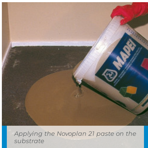
Applying the Novoplan 21 paste on the substrate

Waiting time before installation can vary according to the humidity and ambient temperature, and the thickness and type of flooring to be installed (from 24 to 48 hours).