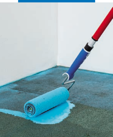
Second coat application of Mapeproof Primer