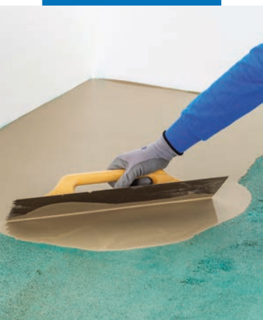
Self-levelling compound application on Mapeproof Primer