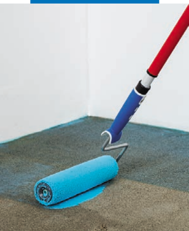
First coat application of Mapeproof Primer