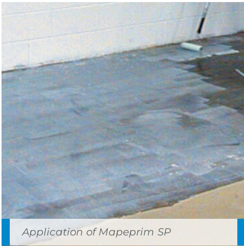
Application of Mapeprim SP