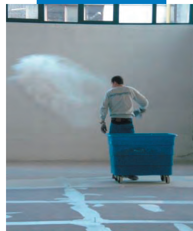
Throwing Quartz 0.9 AU into wet Mapeproof 1K Turbo

All relevant references for the product are available upon request and from www.mapei.com.au