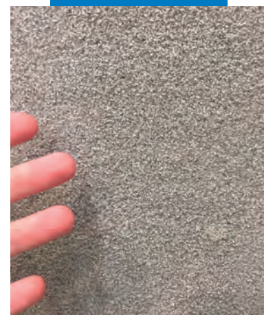
All loose sand removed and final surface completely saturated